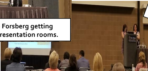
Linda Vainer and Maureen Stresinshe giving oral poster presentation on their poster, Patient Satisfaction Scores: Measuring Customer Perceptions and Values to Promote